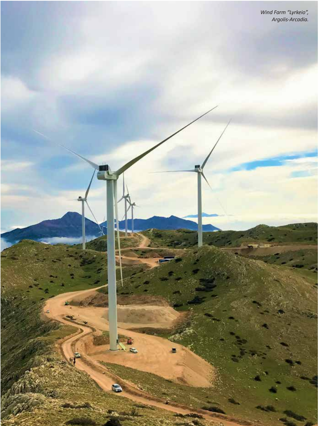
Wind Farm "Lyrkeio", Argolis-Arcadia.