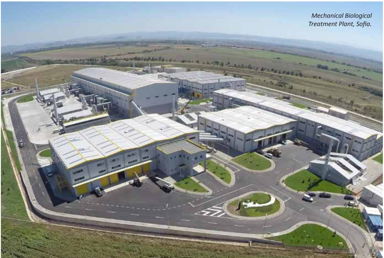
Mechanical Biological Treatment Plant, Sofia.

Business Partners may be given access to confidential information as part of the business relationship. This information should not be shared with anyone, without the expressed authorization of ELLAKTOR. Certain engagements may also require the exchange of personal information. For this purpose, we ensure that the processing and storage of such information is conducted in compliance with the respective data privacy laws and regulations and an appropriate information security framework is implemented.