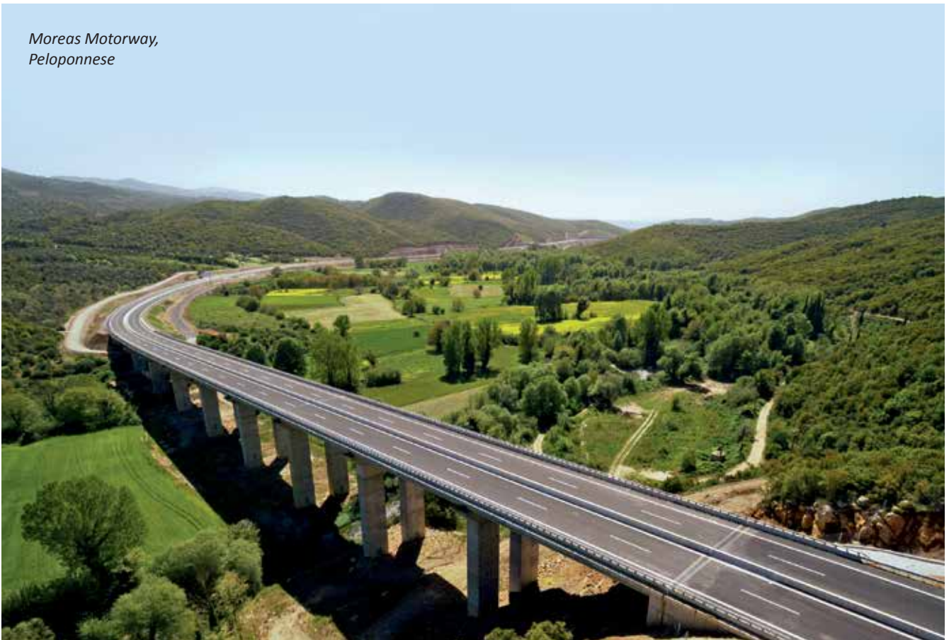
Moreas Motorway, Peloponnese