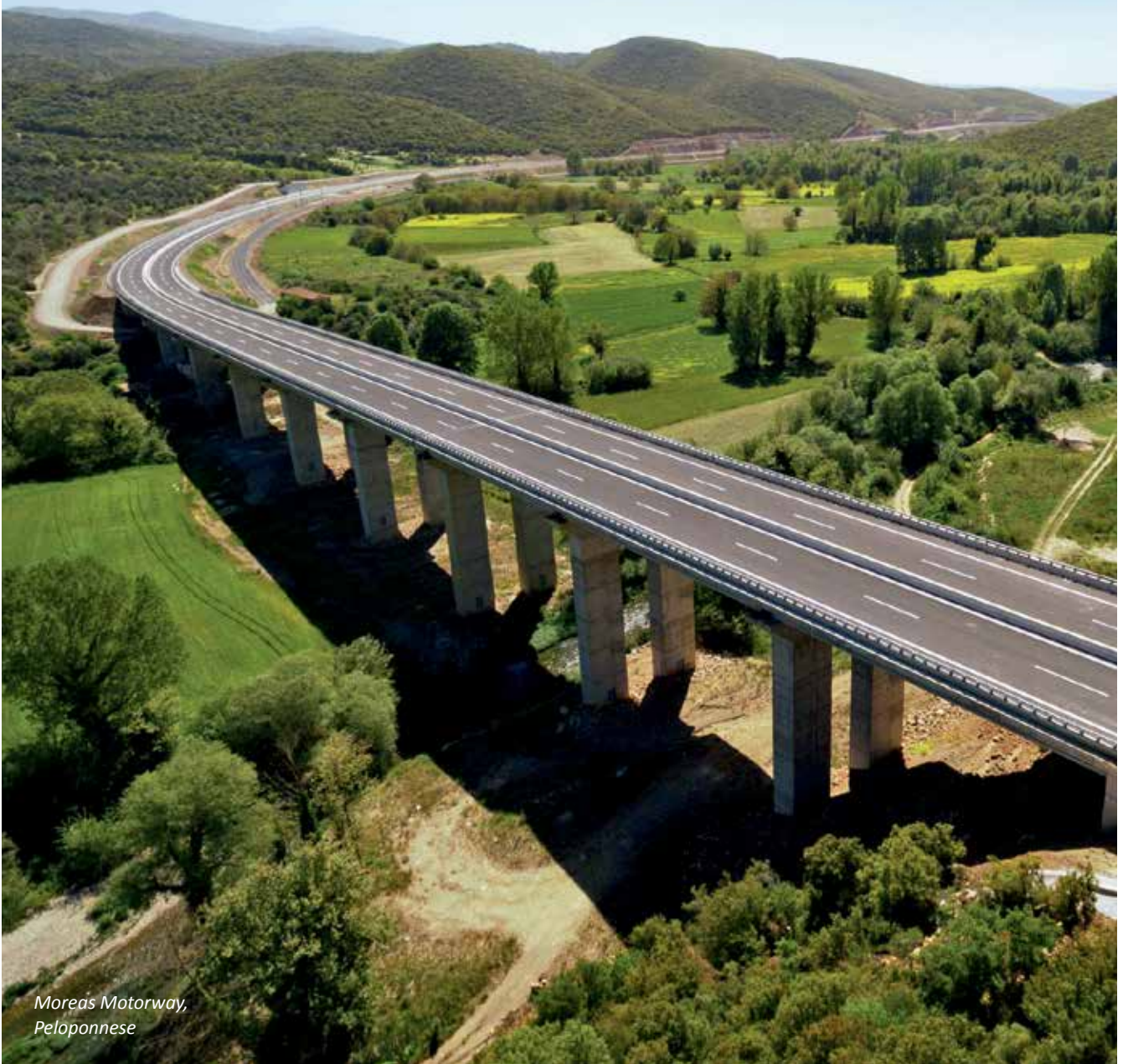
Moreas Motorway, Peloponnese