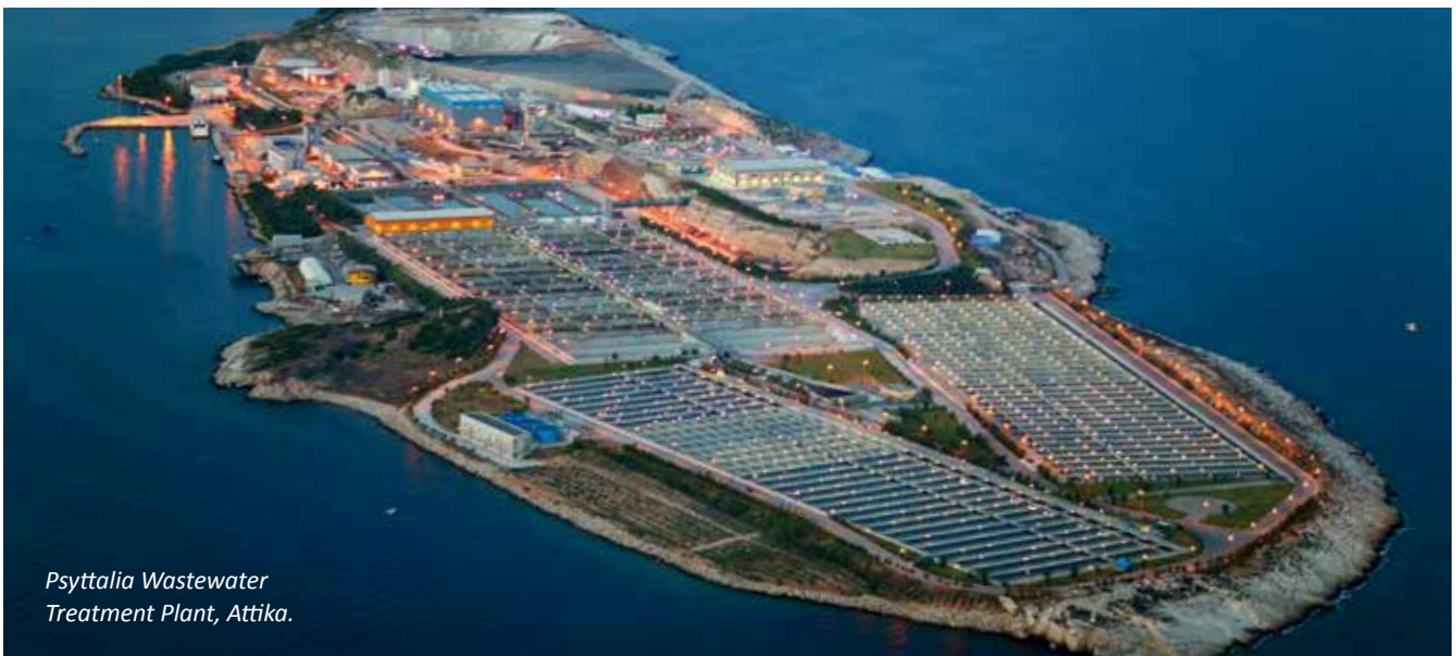
Psyttalia Wastewater Treatment Plant, Attika.

For more information , please refer to ELLAKTOR Group “Conflicts of Interest Policy”.