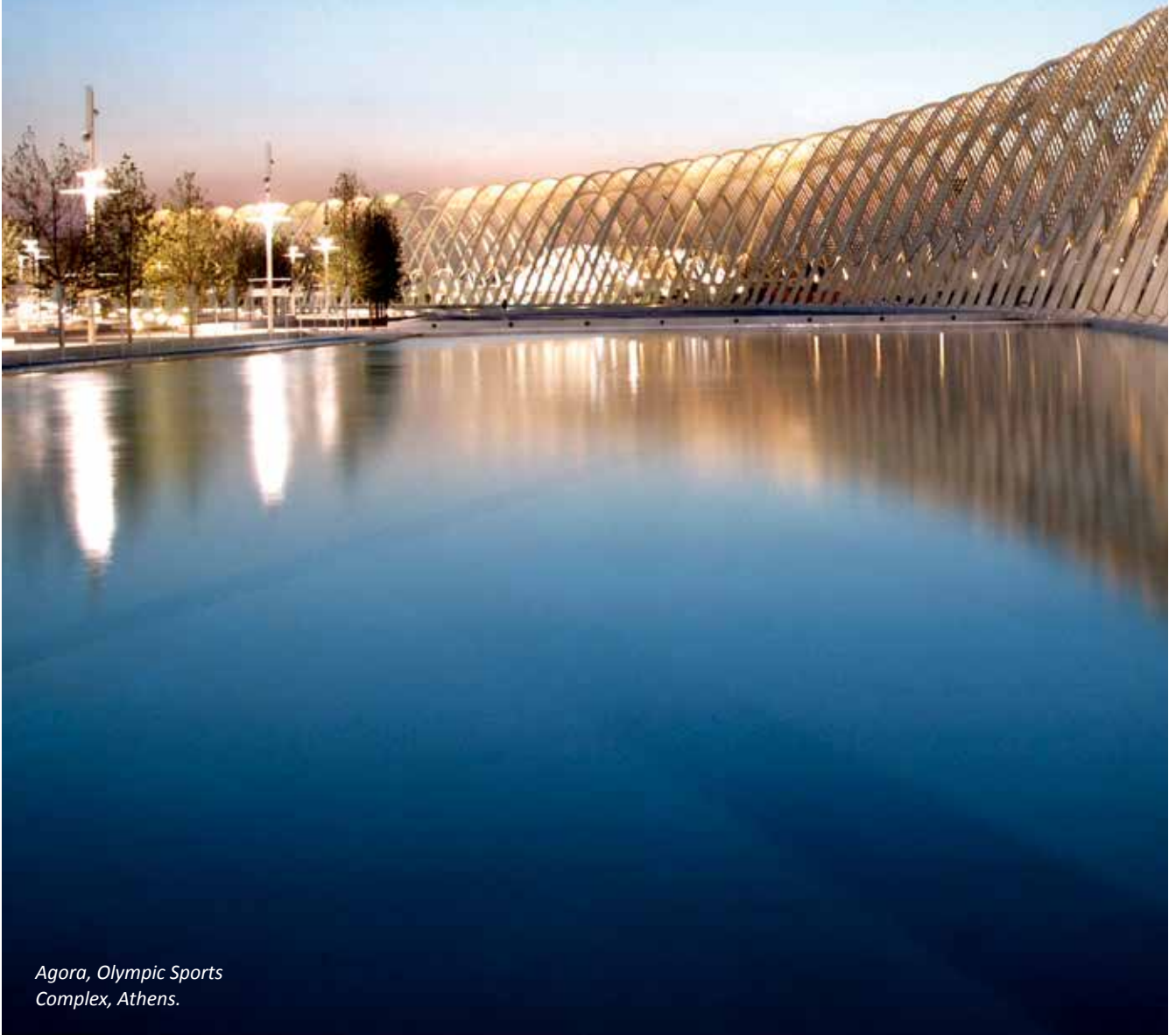
Agora, Olympic Sports Complex, Athens.