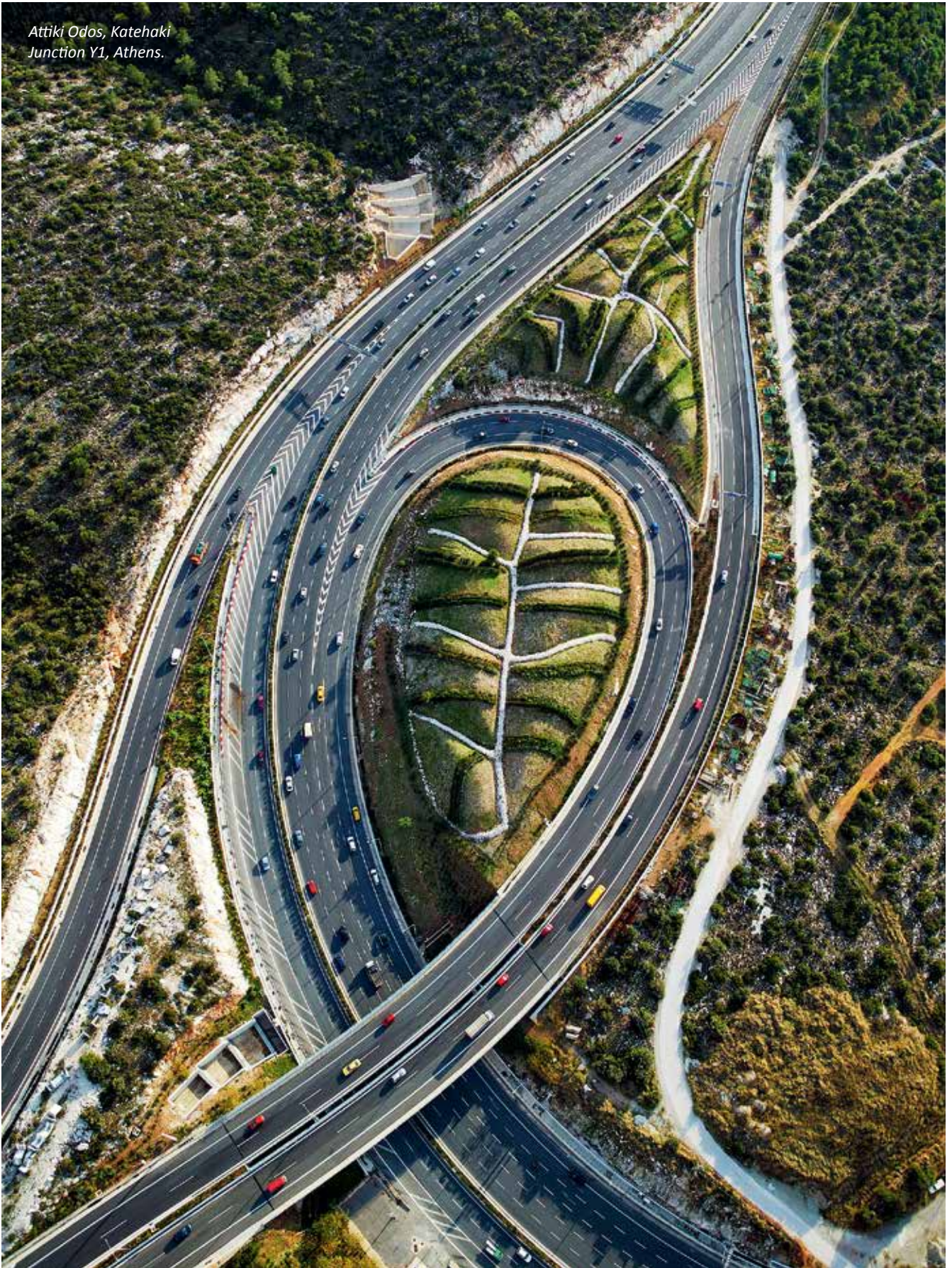
Attiki Odos, Katehaki Junction Y1, Athens.