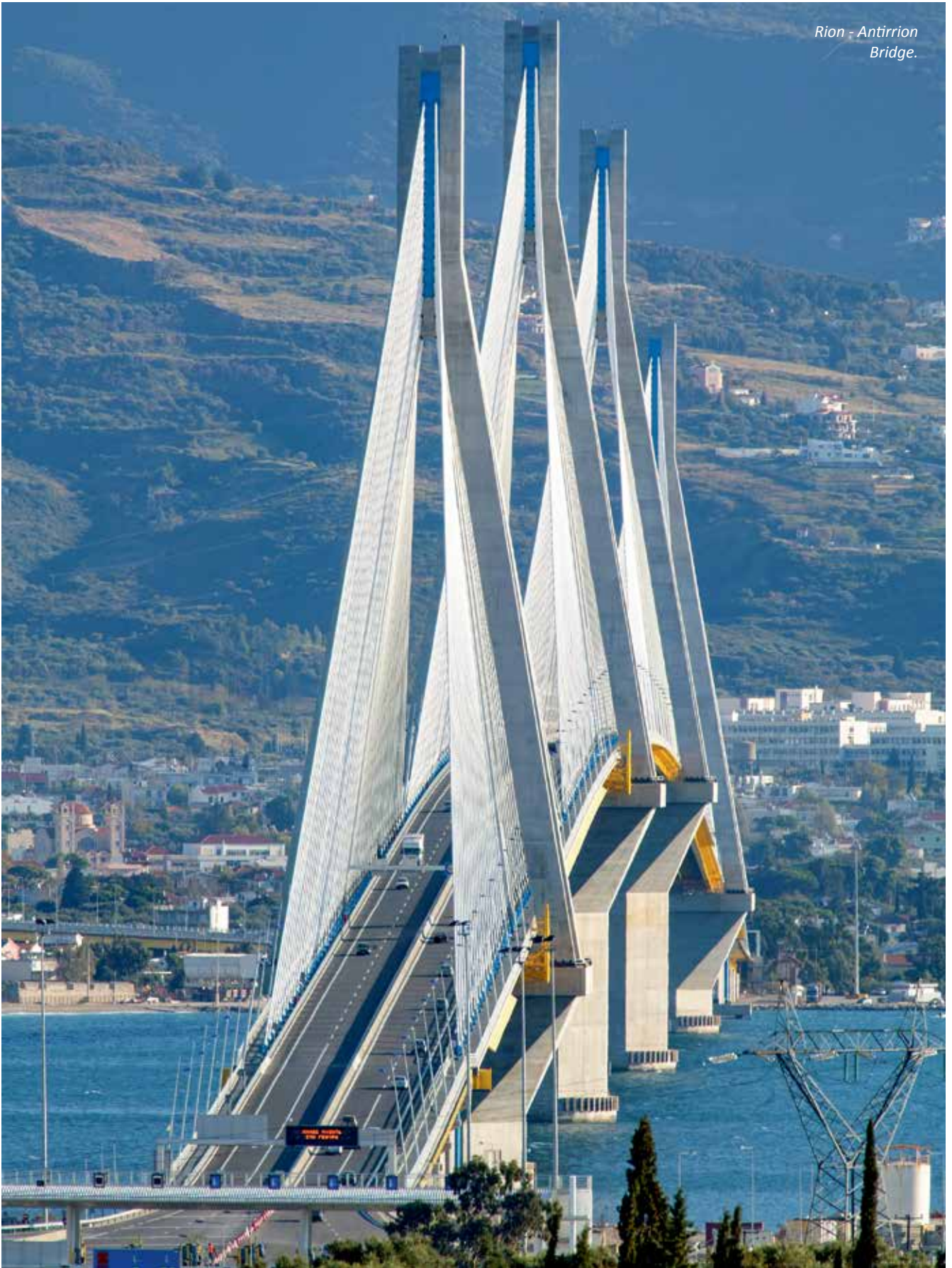
Rion - Antirion Bridge.